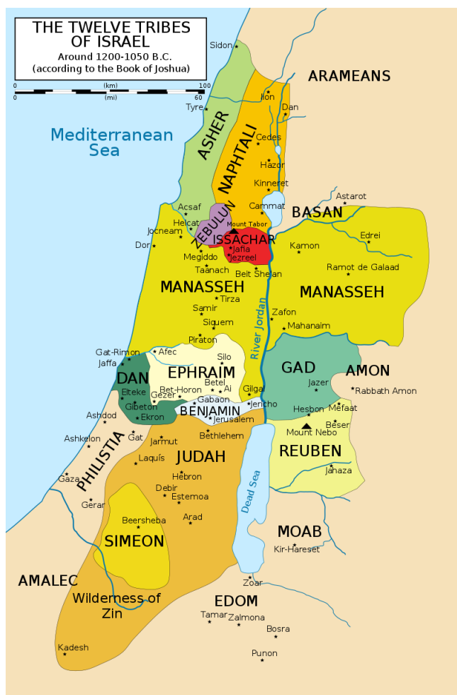
Arnon River on South separates Reuben from Moab Jabbok River on North separates Gad from Manasseh